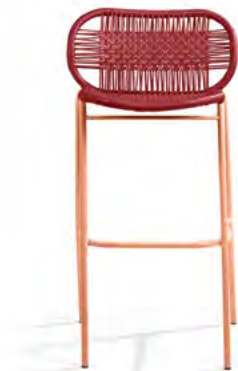
red/pink sand 00ACBS-5