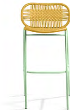
honey yellow/pastel green 00ACBS-6