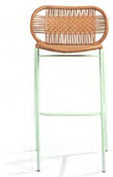
caramel brown/pastel green 00ACBS-7