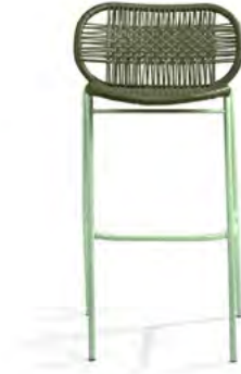
olive green/pastel green 00ACBS-4