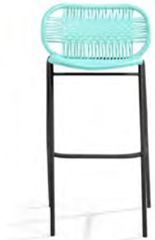
light green/black 00ACBS-2