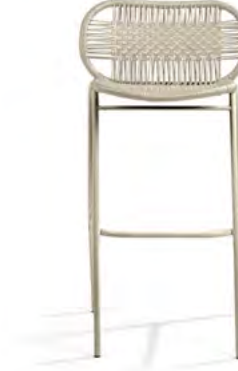
winter grey/pearl white 00ACBS-9